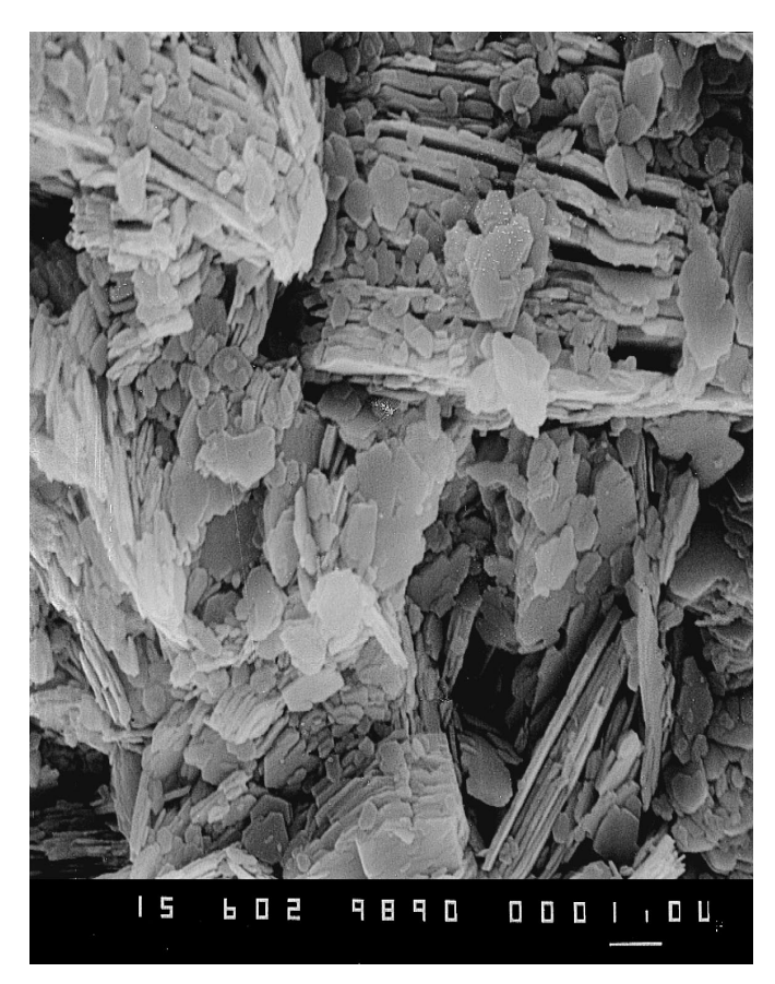
Fig. 1. SEM showing kaolin plates and stacks. Bar = 1 \mu m .

of soluble salts; and dispersability. The presence of a small amount of smectite, illite or halloysite adversely affects viscosity.