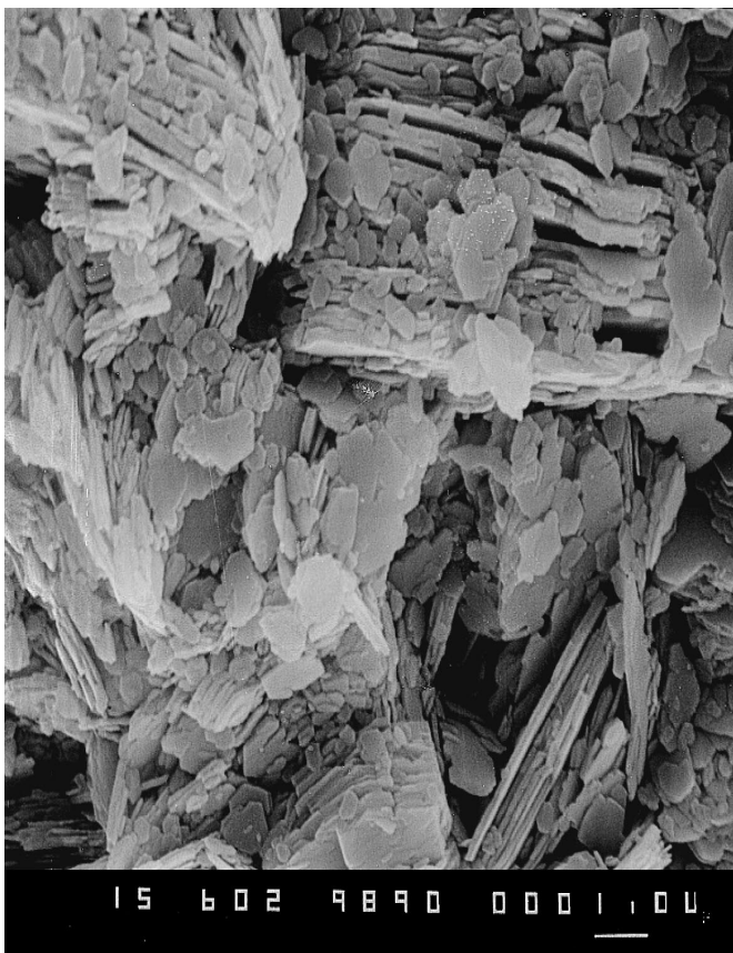
Fig. 1. SEM showing kaolin plates and stacks. Bar = 1 \mu\text{m} .

of soluble salts; and dispersability. The presence of a small amount of smectite, illite or halloysite adversely affects viscosity.